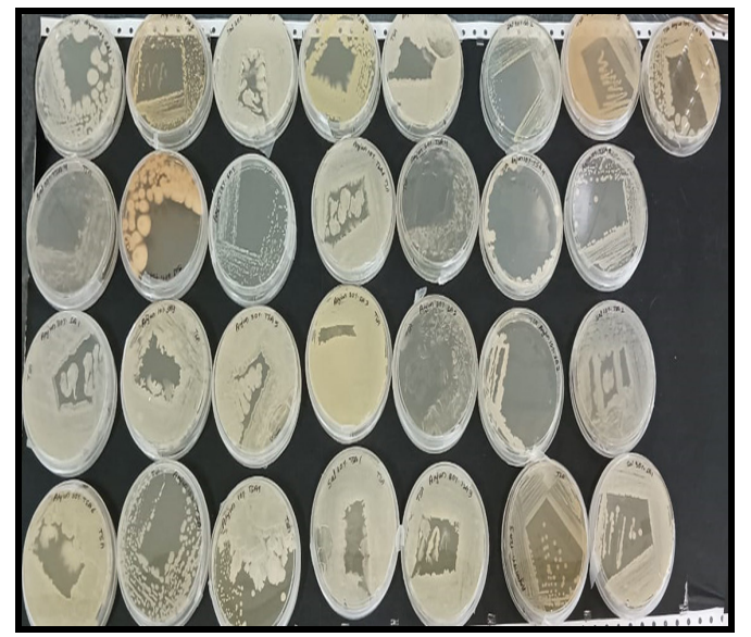
Fig. 1: Bacterial isolates with litter degradation potential

In sal litter, the fungal population was higher than the bacterial population at both the moisture levels. Highest fungal diversity was observed in sal litter whereas highest bacterial diversity was observed in asan. This again can be attributed to the polyphenol content. Shifts in microbial communities to fungal dominance with respect to increasing polyphenol content has been reported (Yakimovich et al. , 2018). The mixture of all the leaves showed population as well as density in similar ranges as the parent material due to contribution from various litter. A total of 29 bacterial isolates (figure 1) and 10 fungal isolates involved in litter degradation were isolated, purified and maintained.